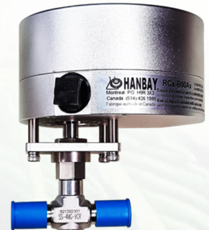
Class I, Div 1, Group B,C,D Class II, Group E,F,G Explosion-proof enclosure