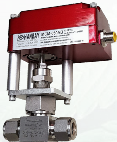
Hanbay actuator with Swagelok SS needle valve (1/2 inch)